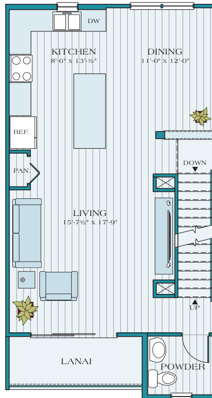
Level 2 730 sq. ft.